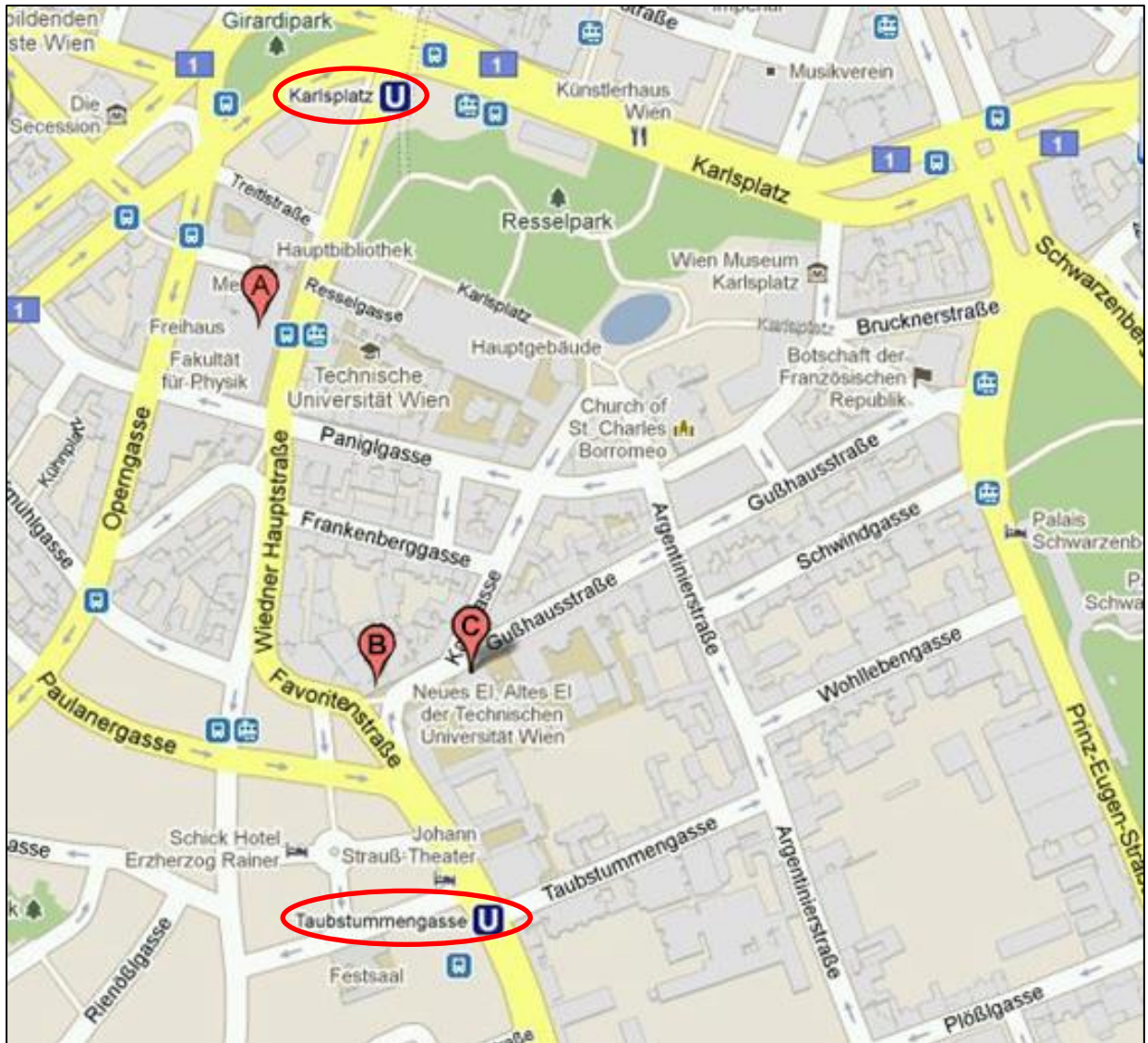
Figure 1: Location of GEO.